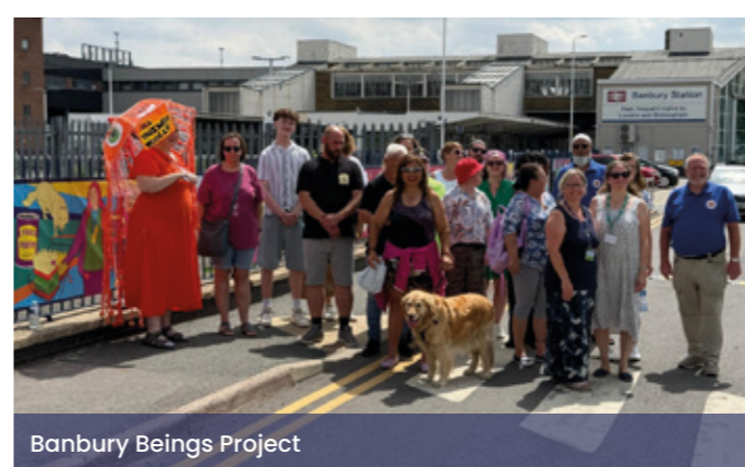
Banbury Beings Project