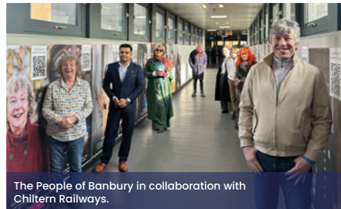
The People of Banbury in collaboration with Chiltern Railways.

Community wellbeing remained important with our popular Dog Walk, while the festive season delivered standout moments through the Winter Market, Lantern